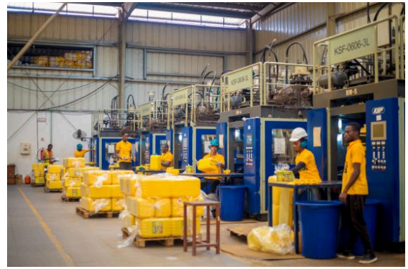
Scaling manufacturing at Jolaks

So Pure secures major investment after Invest Salone support strengthens business readiness. Click here to read the full article.