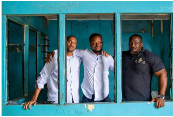
Major investment deal secured by So Pure

So Pure secures major investment after Invest Salone support strengthens business readiness. Click here to read the full article.