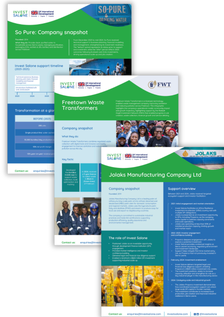
Investment impact infographics for So Pure, Freetown Waste Transformers and Jolaks