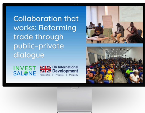
Collaboration that works: Reforming trade through public-private dialogue