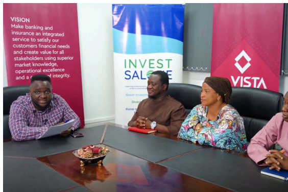
Roundtable discussion on the partnership between Vista Bank, Small Foundation and Invest Salone

Finance That Fits: Shaping the future of capital in Sierra Leone. Click here to read the full article.