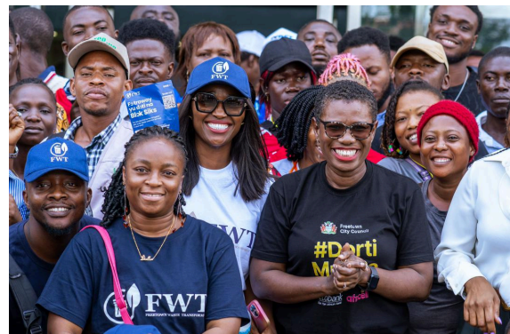
Freetown Waste Transformers staff

Finance That Fits: Shaping the future of capital in Sierra Leone. Click here to read the full article.