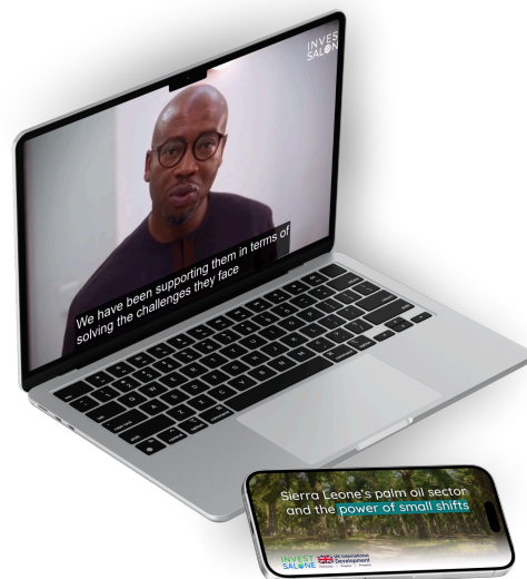
Sierra Leone's palm oil sector and the power of small shifts