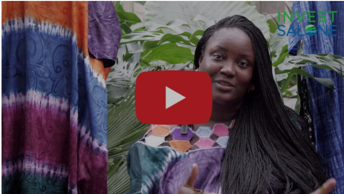
Made in Salone: Transforming gara production for Sierra Leone's textiles industry

The ‘Made in Salone’ series continues with a look at how Sierra Leone’s textiles and clothing sector is creating new markets for traditional fabric and design techniques. Read more or watch below.