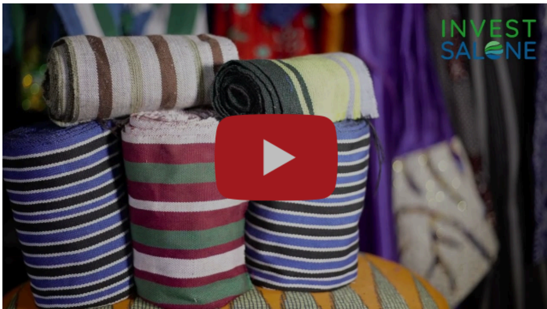
Made in Salone: Revitalising the use of Country Cloth in Sierra Leone