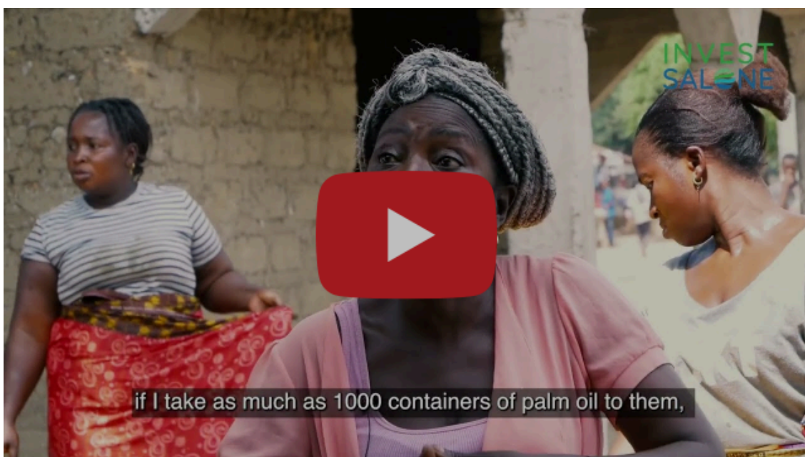
Made in Salone: Transforming oil palm production in Sierra Leone