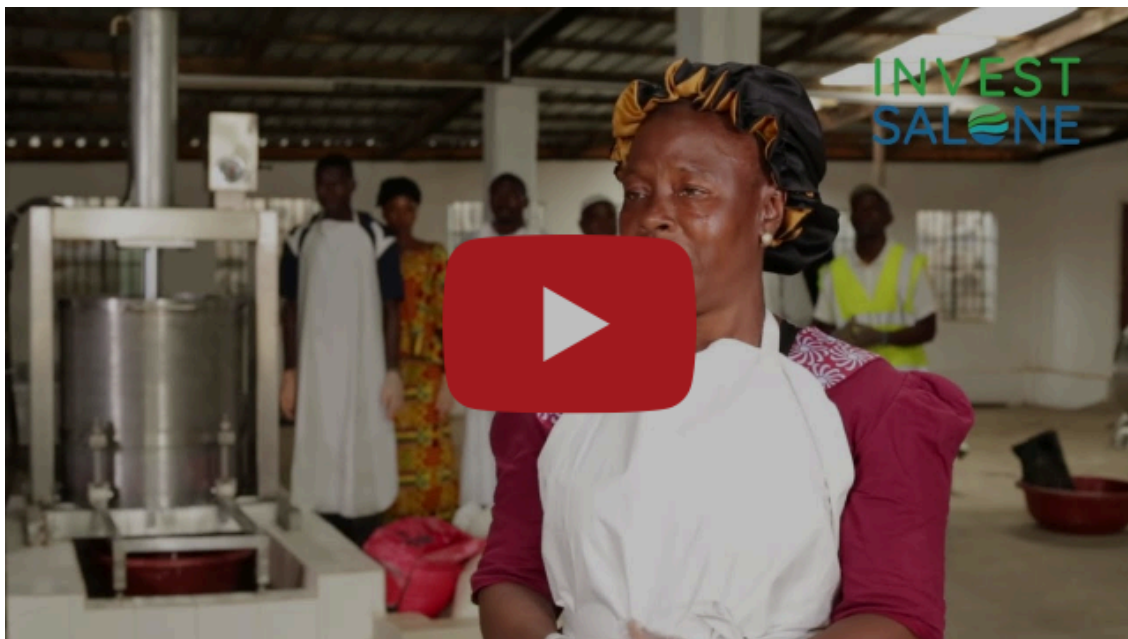
Made in Salone: Transforming cassava production in Sierra Leone

Invest Salone's Made in Salone series continues with a look at how domestic businesses are adding value to local agricultural produce and, in the process, meeting Sierra Leone's demand for essential products and improving livelihoods for farmers and farming communities. Read more or watch below.