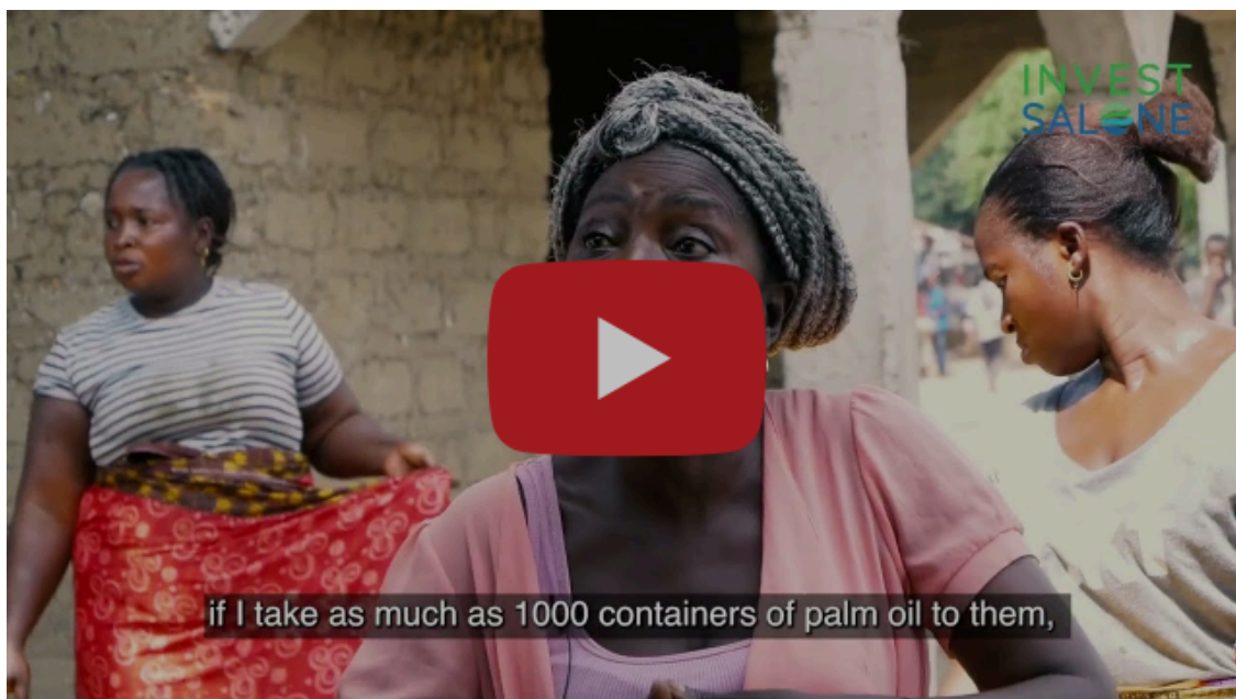
Made in Salone: Transforming oil palm production in Sierra Leone