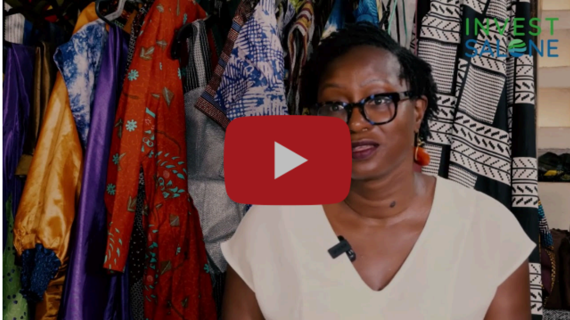
Made in Salone: Revitalising Sierra Leone's textiles and clothing sector

Discover how designers are championing their heritage by giving a contemporary twist to classic Sierra Leonean textiles and techniques. Read more or watch below.