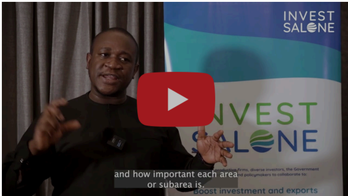
Invest Salone launches Investment Toolkit for SMEs in Sierra Leone

Complementing our recently launched Investment Toolkit for SMEs , is a new resource designed to accelerate investment into the Sierra Leonean market. The Investment-Readiness Insights Report provides impact investors with practical guidance on how to support SMEs to become more investment ready. Read more or watch the launch event video below.