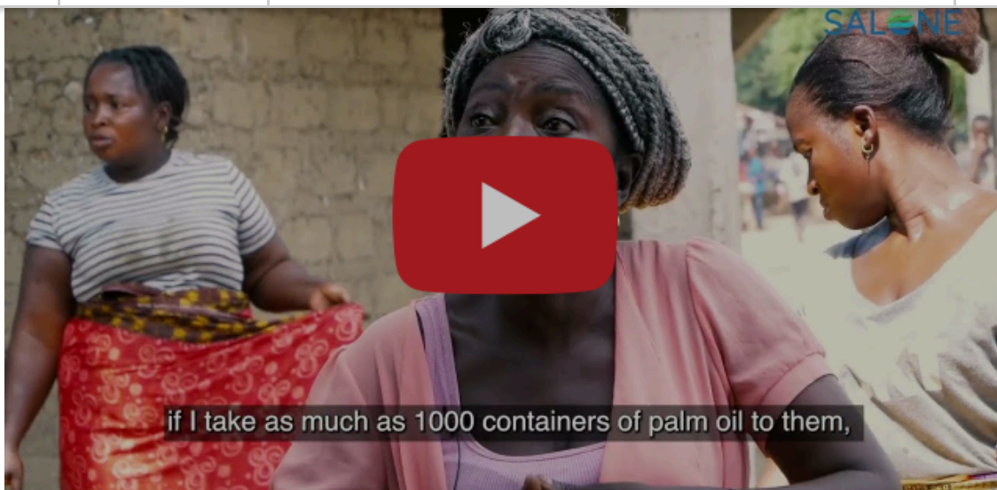
Made in Salone: Transforming oil palm production in Sierra Leone