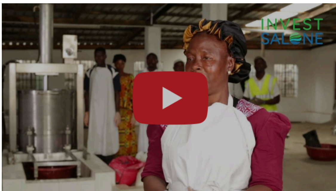
Made in Salone: Transforming cassava production in Sierra Leone

Invest Salone's Made in Salone series continues with a look at how domestic businesses are adding value to local agricultural produce and, in the process, meeting Sierra Leone's demand for essential products and improving livelihoods for farmers and farming communities. Read more or watch below.